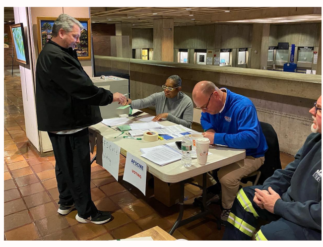
(Above) Local 1631 Assessing and Code Enforcement, Local 783 Boston Transportation Department, and Local 1198 City of Boston Engineers vote at City Hall.

(Left) Local 296 and 804 members, with the Boston Parks Department, vote on their new 3-year contract at Franklin Park Yard on March 15th